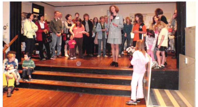
RE Teachers were honored on May 16 in Channing Hall